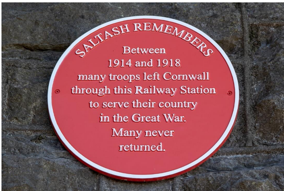
The above image is a memorial plaque located on Saltash Railway Station which is installed next to the story board on the Station.