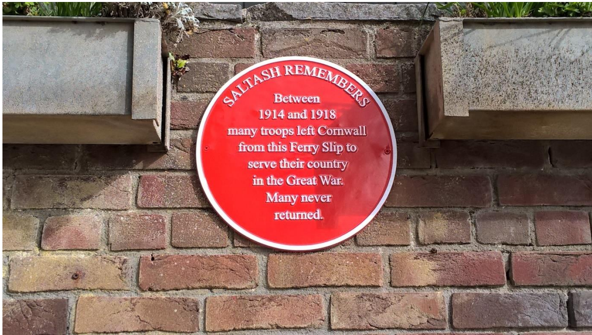
The above image is a memorial plaque on the Saltash Waterside (hosted by Ashtorre Rock).